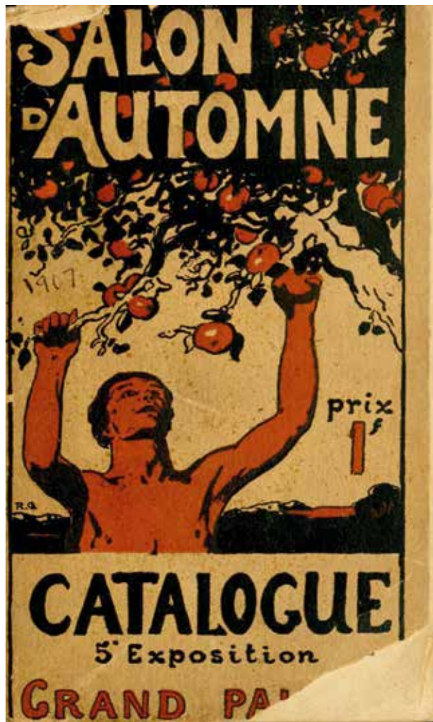
Cover of the Salon d'Automne catalogue, Grand Palais des Champs-Élysées, Paris, 1907