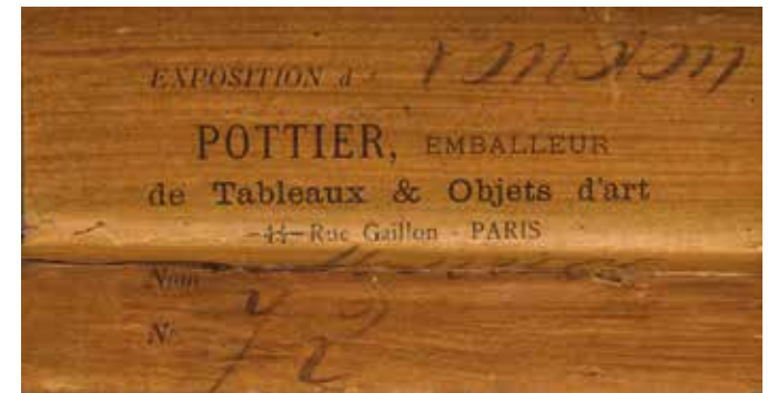
labels on verso

The exhibition history is further documented by the original frame, which still bears two important period labels. At the top of the frame is the original handwritten exhibition label, inscribed “Morrice – Le Pont,” with the catalogue number 1310 from the 1907 Salon d'Automne . The same label also bears the word Effet , which has been crossed out—most probably a reference to Morrice's other submission to the Salon that year, Effet de neige (Canada) , #1309. On the right side of the frame is a shipping label from Pottier, Emballeur de Tableaux & Objets d'art, 14 Rue Gaillon, Paris, printed with the word Exposition . Pottier was one of the leading packers and shippers of artworks in Paris, widely used by artists, dealers and institutions in the late nineteenth and early twentieth centuries. Together, these original labels highlight the work's exhibition history.