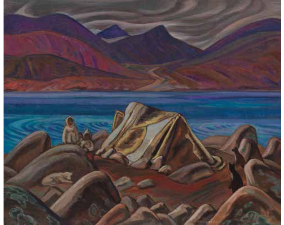
Alexander Young (A.Y.) Jackson Eskimo Summer Camp, Pangnirtung

oil on board, 1935 12 x 15 in, 30.5 x 38.1 cm ESTIMATE: $90,000 – 120,000