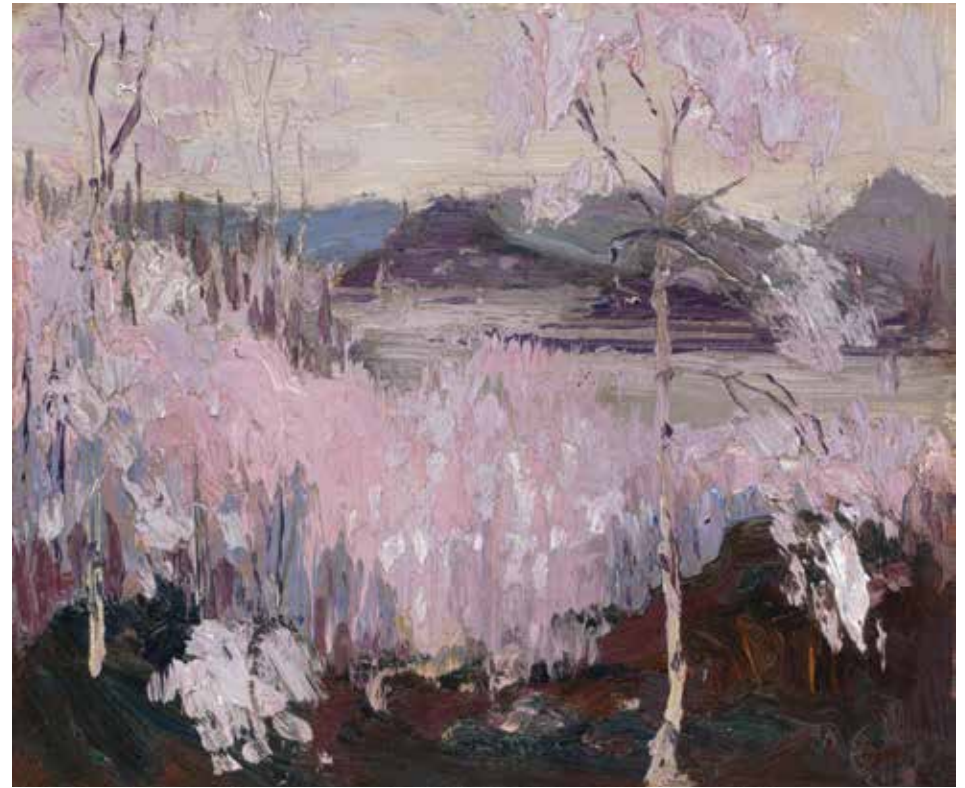
Thomas John (Tom) Thomson Sleet Storm

oil on canvas on board, 1914 8 ½ x 10 ½ in, 21.6 x 26.7 cm