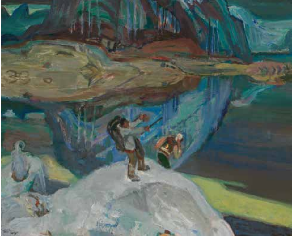
Frederick Horsman Varley Indians, Rice Lake, BC

oil on board, 1935 12 x 15 in, 30.5 x 38.1 cm ESTIMATE: $90,000 – 120,000