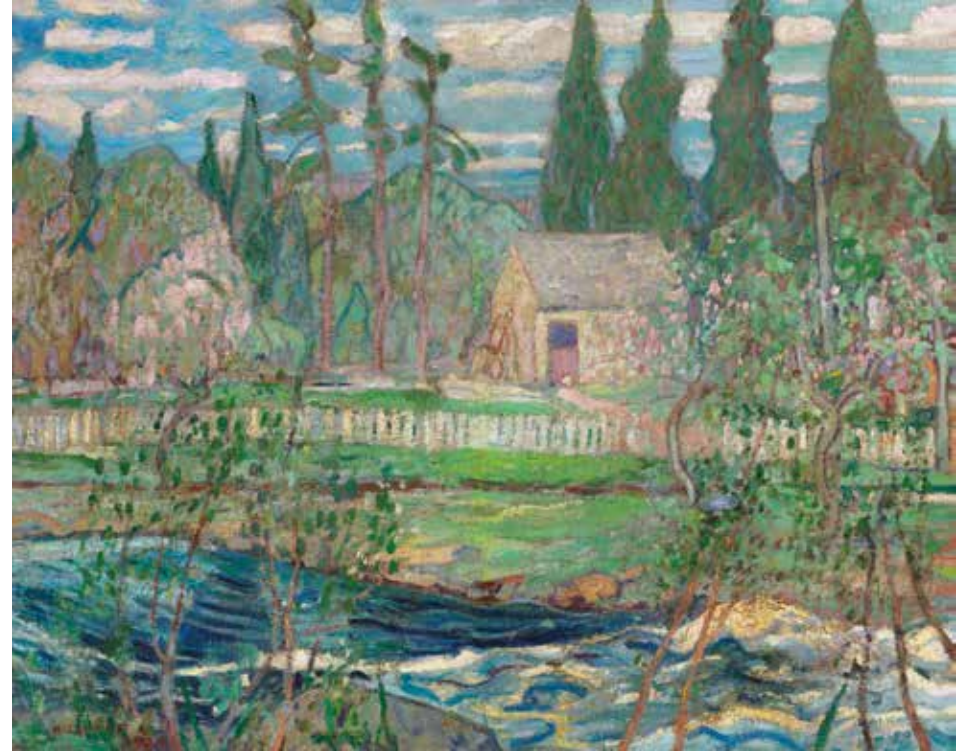
Arthur Lismer Spring on the Sackville River, ns

oil on board, 1938 24 x 31 in, 61 x 78.7 cm ESTIMATE: $400,000 – 600,000