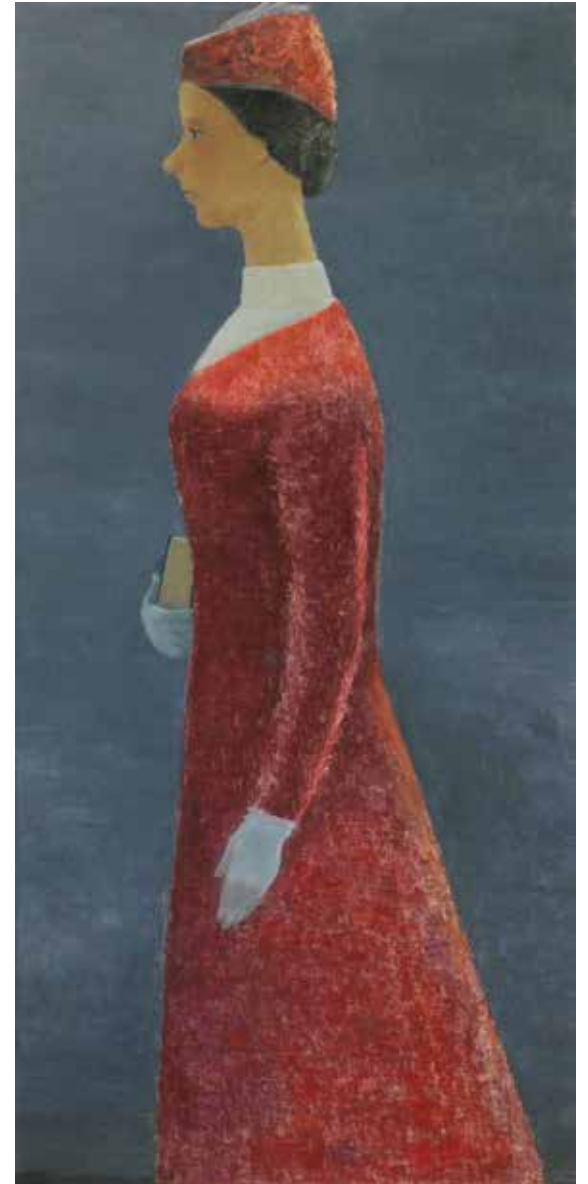
Jean Paul Lemieux Dimanche

oil on board, circa 1941 31 x 47 ½ in, 78.7 x 120.6 cm ESTIMATE: $700,000 – 900,000