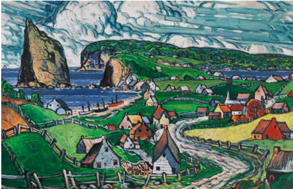
Marc-Aurèle Fortin Gaspésie

oil on board, circa 1941 31 x 47 ½ in, 78.7 x 120.6 cm ESTIMATE: $700,000 – 900,000