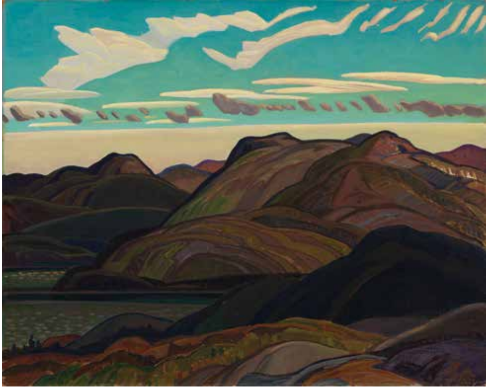
Franklin Carmichael Late Evening

oil on board, 1938 24 x 31 in, 61 x 78.7 cm ESTIMATE: $400,000 – 600,000