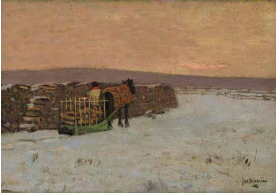
James Wilson Morrice The Woodpile, Sainte-Anne-de-Beaupré

oil on canvas, circa 1900 18 x 26 in, 45.7 x 66 cm